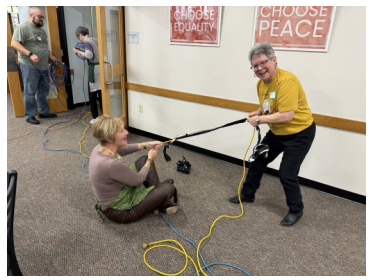
Nov.19 2023 Thanksgiving Meal