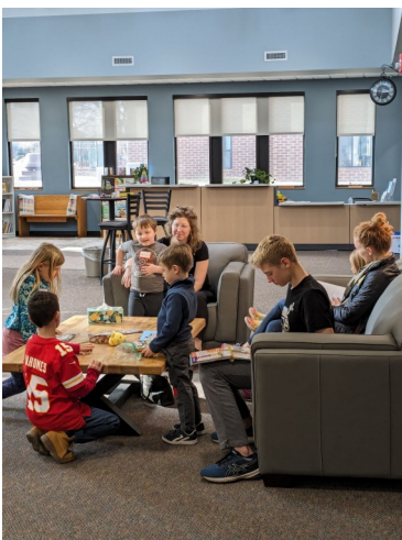
SUNDAY, FEBRUARY 11: In honor of Black History Month, Pathways participants of all ages read books together that highlighted people of color who have made a difference in our world.