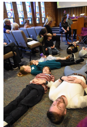
FEBRUARY 18: Piano Quartet and Children's Message