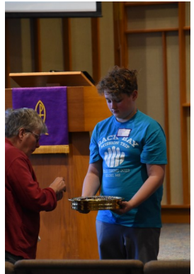
Scenes from Sunday, March 3, 2024