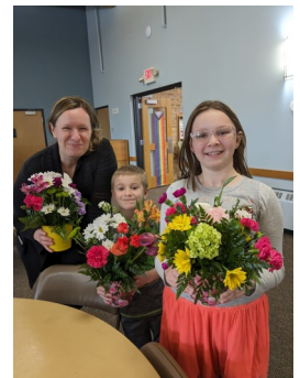
Flower Arranging Class on March 23, 2024