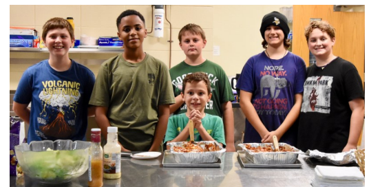
LEFT: 9-24-23 Pathways leaders and youth create salad and cookies for the Wednesday Night meal RIGHT: 9-27-23 Teens & Youth serve Wednesday Meal