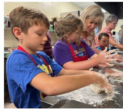
9-24-23 Pathways leaders and youth create Lasagna and bread for the Wednesday Night meal