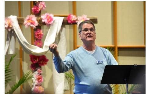
Scenes from Sunday April 7, 2024