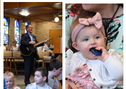
Scenes from Easter Sunday, March 31 2024