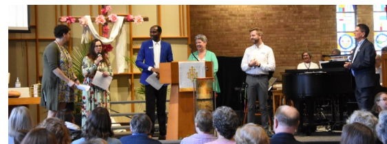
Scenes from Easter Sunday, March 31 2024