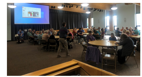
African Unity Day Meal on May 24th