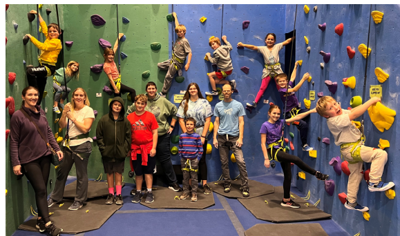
Above left: Rock-climbing at ROCA Above Middle and right: Faith Formation activities