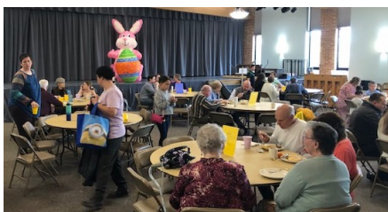
Image : Everyone enjoying the Easter breakfast

The zoom link to our May 8th meeting is: https://us02web.zoom.us/j/82773627208?pwd=ZE4waTFRMTNBmZ5aW4za3hmTjRLZz09